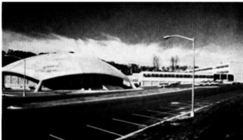
The geodesic dome is the principal design element in this new field house at Walt Whitman High School, Bethesda, Maryland (see story above).

821-823 ARCH STREET PHILADELPHIA, PA. 19107