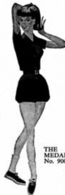
THE MEDALIST No. 900